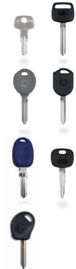
with adaptor 带适配器

More versions for specific markets are available.